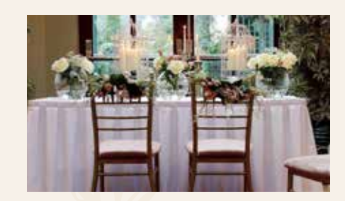
ONCE IN A WHILE, RIGHT IN THE MIDDLE OF AN ORDINARY LIFE, LOVE GIVES US A FAIRYTALE.